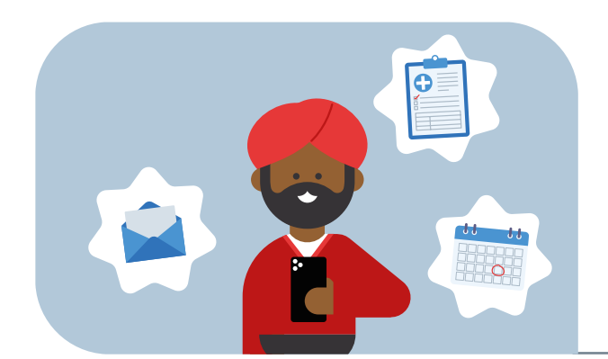
View letters, discharge summaries and appointments all in one place.