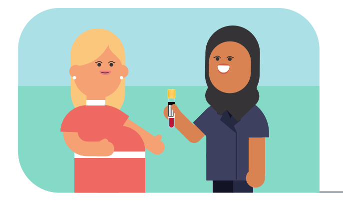
View your blood test results. You can also view your family members' results if you have their permission.