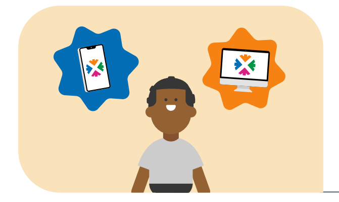
Adults, children and young people can access the Care Information Exchange on your mobile or computer.

With the Care Information Exchange, you can securely access your hospital health records online.